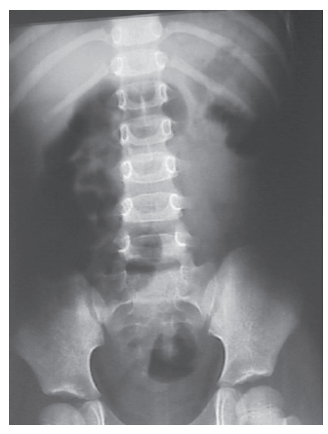
Figure 1. Plain X - ray could not identify any tumor mass