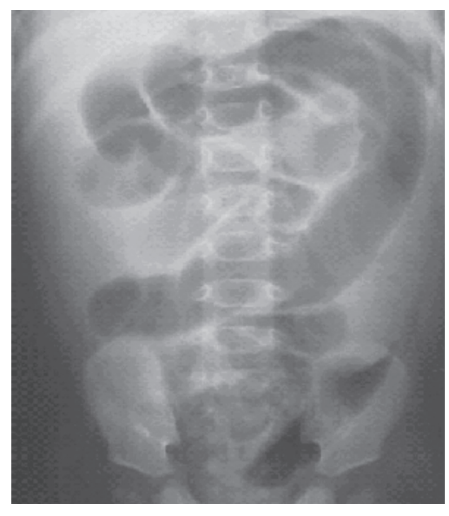
Figure 3. Plain abdominal x-ray shows no obvious abnormality